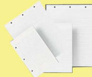
School/ Office paper