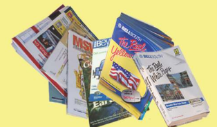
Magazines/Catalogs/ Telephone books