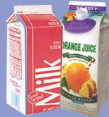
Milk and juice cartons