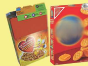
Dry food boxes