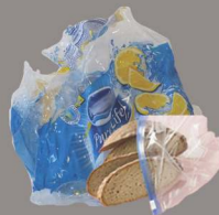
Sandwich bags/ Shrink wrap