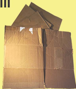
Corrugated cardboard (flattened and cut to 3'x3' maximum)