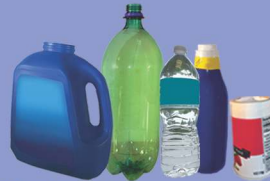
Plastic bottles and containers (up to 5 gallons)